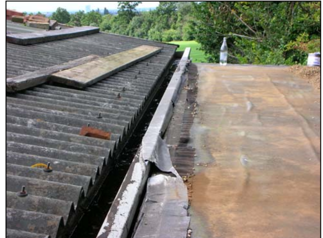
Shingle swept out of the way, you can see the extent of the problem. The full length of the building the flashing tape has failed.

Thick ¼ inch roofing felt. We bought a roll that was 8m x 1m and proceeded to cut it in half down the length, leaving two strips each 8m x 0.5m. Enough to do 16 meters (effectively)