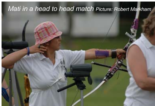
Mati in a head to head match

The last match is on the 3 rd of September and is an away match with presentation at Aquarius Archery Club. Attendance has been very disappointing lately. Please show your support.