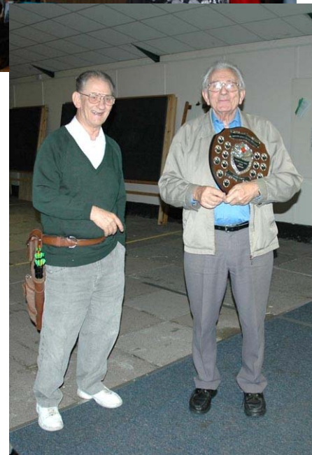
Here are some pictures taken at the Short Metric League Presentation Shoot at Aquarius in September.