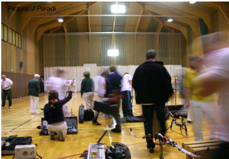
Chaos in between sessions at the County Indoor Championships